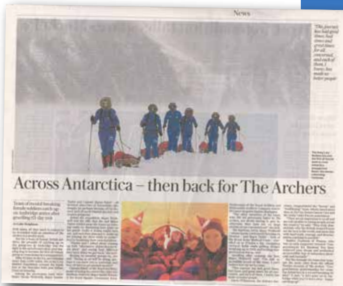
Bottom right: Taking a well earned break.