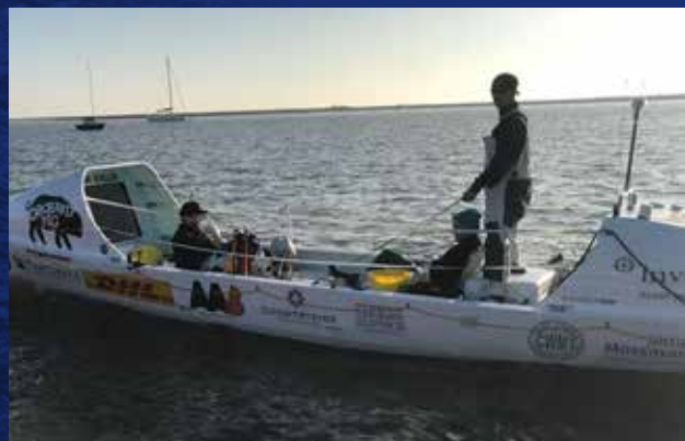
Below: Last few days of training and testing.