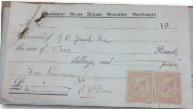
We always enjoy receiving memorabilia from alumni, including recent copies of an invoice for £2, a table of Premiums for Boarders and the 1931 School photograph. ●