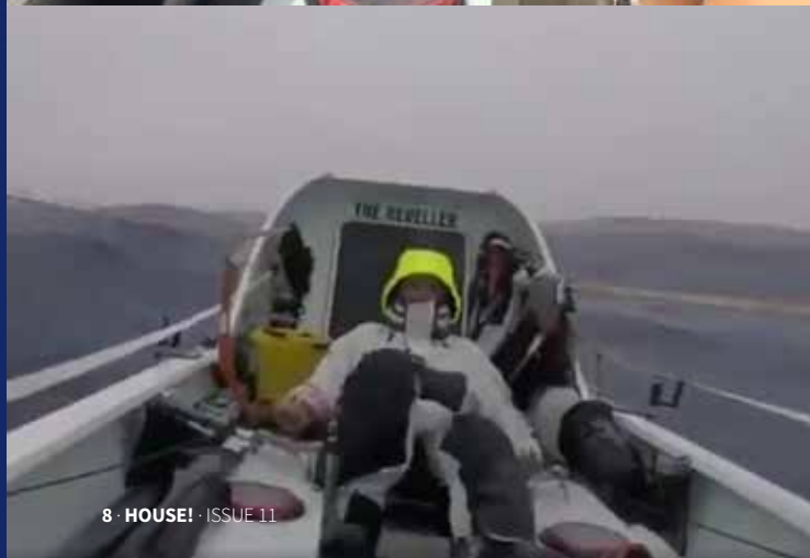
Below right: Celebrations after completing the challenge.