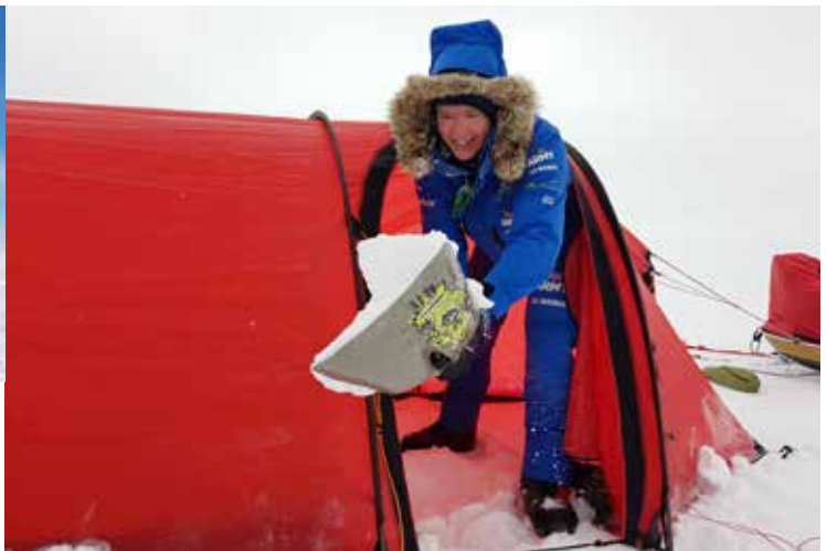
Right: Setting up camp Antarctica style.

Initially I didn't think I would be strong enough or bring anything extra to the team but the aim of inspiring other women to be more active and to chase their dreams drove me to keep trying.