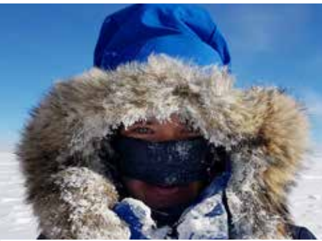
Left: Extreme camping; one of the team's basecamps.