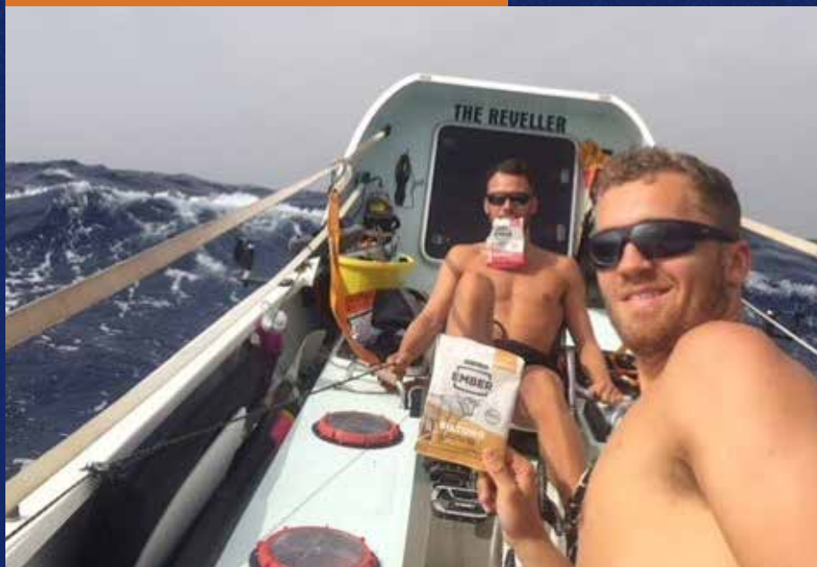
Left: A snack reward after crossing the half way milestone.