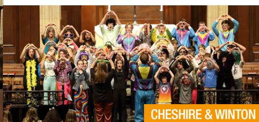
CHESHIRE & WINTON