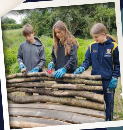
General maintenance such as sanding and coating chairs, and clearing waterweed from streams at Evenley Wood Garden.

Buckingham Primary School had a visit by Stoics with pupils helping with general maintenance tasks around the school and working with much younger pupils.