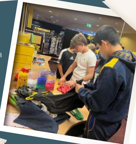
Sorting donated items for resale at Willen Hospice.

The ForEver Stowe group invited the SEN Evergreen School from Warwick to bring 36 of their pupils and some of their teachers to Stowe for a day filled with fun activities. Stoics helped the ForEver group in hosting the pupils, acting as runners, showing the visitors to the toilets, helping with the activities and lunch, and generally making The Evergreen School pupils feel welcome. It was a great day out for pupils with serious life difficulties but also benefitted Stoics who had a great chance to perfect their empathy skills.