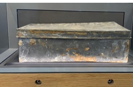
One of the metal boxes which made up the Oneg Shabbat, displayed in the Imperial War Museum, containing a wide range of material to record the lives of the Jews in ghettos.